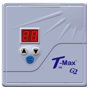
Front View of T-Max® 3W G2